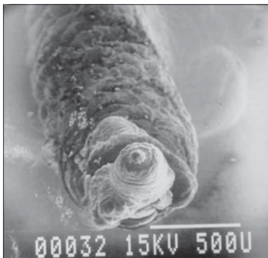
Figure 1. SEM photograph of the body morphology of Neoechinorhynchus sp.