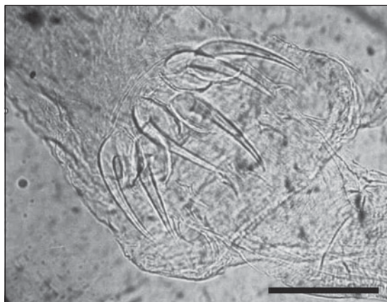
Figure 5. Light microscope photograph of proboscis with all the hook rings (40x; bar = 60 \mu m); note the tremendous difference in size among hooks.