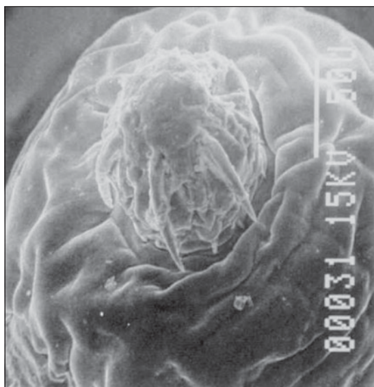
Figure 3. Globular proboscis with hook rings and anterior part of Neoechinorhynchus sp.