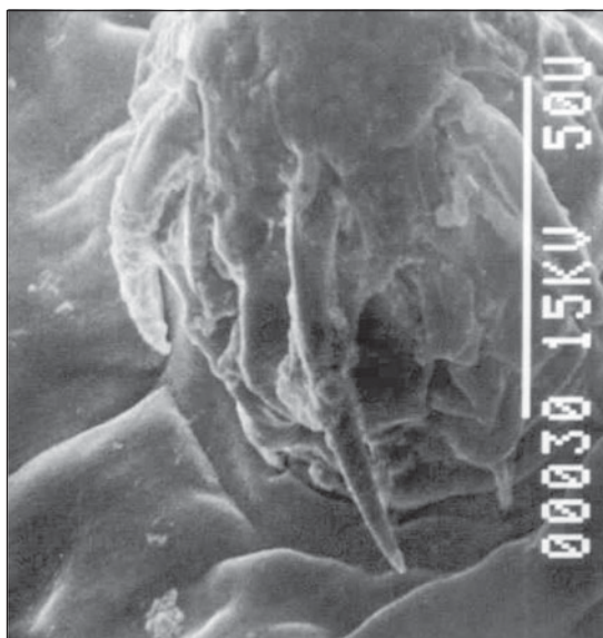
Figure 4. Ultrastructural appearance of the largest hooks located in the anterior ring of hooks. This is a key taxonomic feature for identification of Neoechinorhynchus genera.

9.5 mm). The proboscis is typically shorter and narrower than that of N. prochilodorum and N. pterodoridis (the proboscis length and width in N. prochilodorum is 83 \mu\text{m} and 93 \mu\text{m} respectively and in N. pterodoridis it is approximately 127 \mu\text{m} and 119 \mu\text{m} respectively,