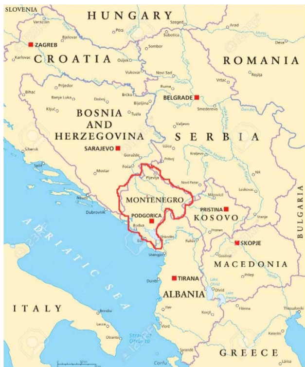
Fig. 1. Geographical location of the Republic of Montenegro.

Subjects who did not originate from the territory of Montenegro were also excluded from this research. According to Marfell-Jones et al. (2006), anthropometric measurements, including body height and shoulder blade length, were taken in compliance with the protocol of the International Society for the Advancement of Kinanthropometry (ISAK). The age of the subjects was determined by asking them their date of birth.