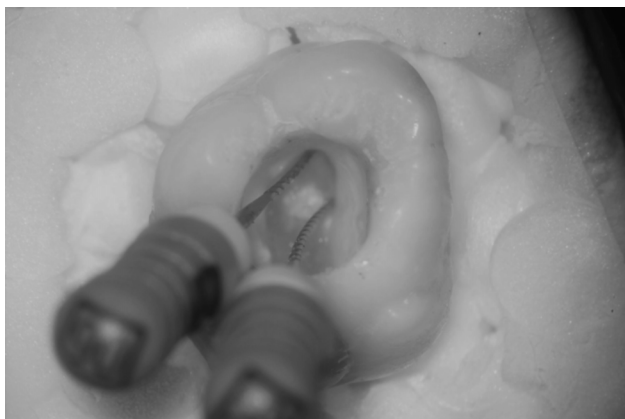
Fig. 2. The number of mesiobuccal canals was clinically determined through visual inspection of the canals orifice entrances on the pulp-chamber floor using an endodontic explorer with posterior insertion of number 06, 08, or 10 K-file (Dentsply, Catanduva/SP, Brazil) to evaluate the accessibility of the canals (dental operating microscope, 16x magnification).