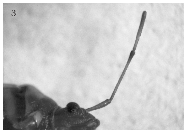
Fig. 3. Teratological specimen of Idiostolus insularis , detail of right antenna, ventral view.

20-I-2011, Jardín Botánico Carl Skottsberg, Instituto de la Patagonia, Carvajal & Faúndez leg, 1♀, on Nothofagus antarctica (Mirb.) Oerst (Nothofagaceae). (Deposited in the Heteroptera Reference Collection of the Centro de Estudios en Biodiversidad, HRCC).